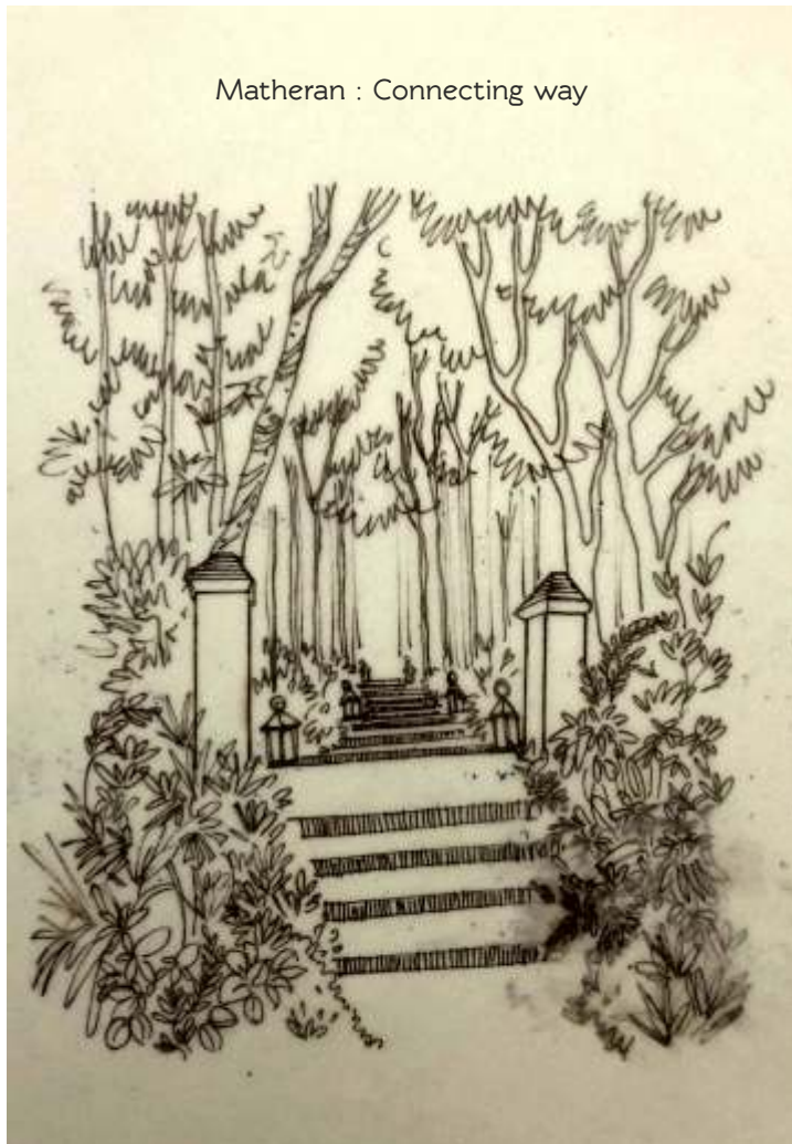
Matheran : Connecting way