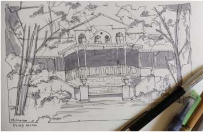
Sketch of Dune Barr Heritage Hotel

• Recognized under Section 2f of UGC Act, 1956 • ISO 9001 : 2015 Certified