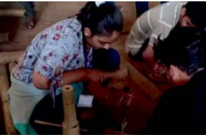
First Year to KONBAC (Bamboo Workshop) at Sindhudurg, Maharashtra