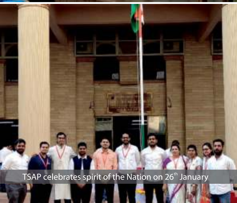
TSAP celebrates spirit of the Nation on 26 th January