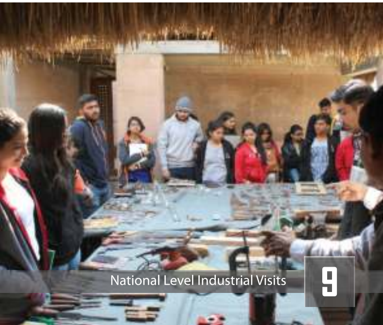
National Level Industrial Visits