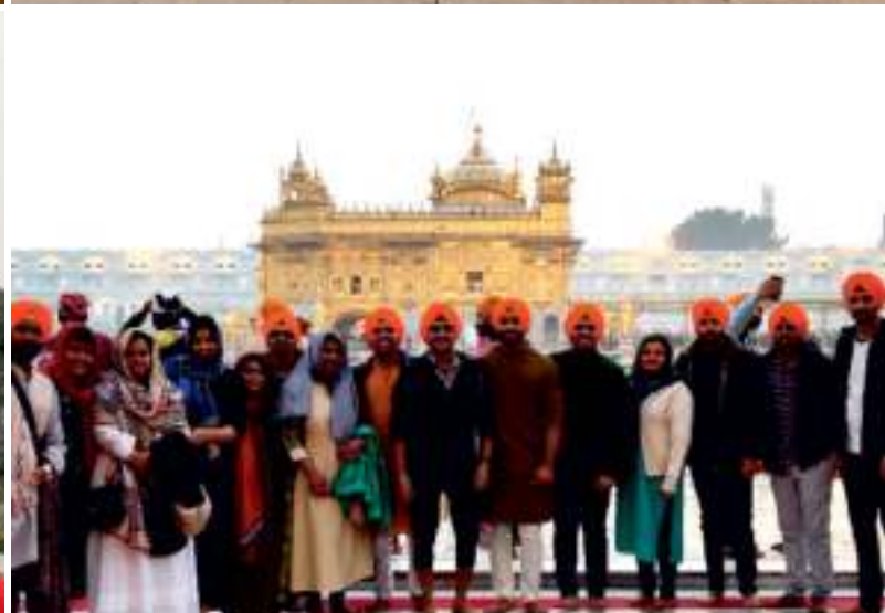
Fifth Year to Study of Contemporary & Colonial Architecture, Amritsar, Punjab & Shimla, Himachal Pradesh