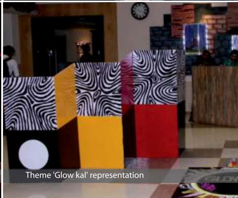
Theme 'Glow kal' representation