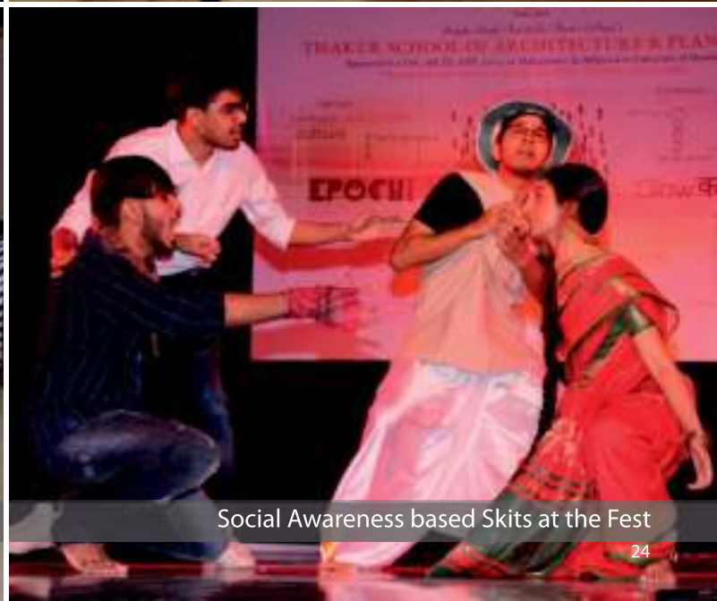
Social Awareness based Skits at the Fest