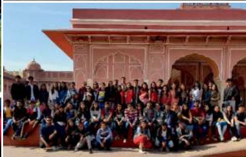
Third year to Study of Traditional township at Jaipur, Rajasthan