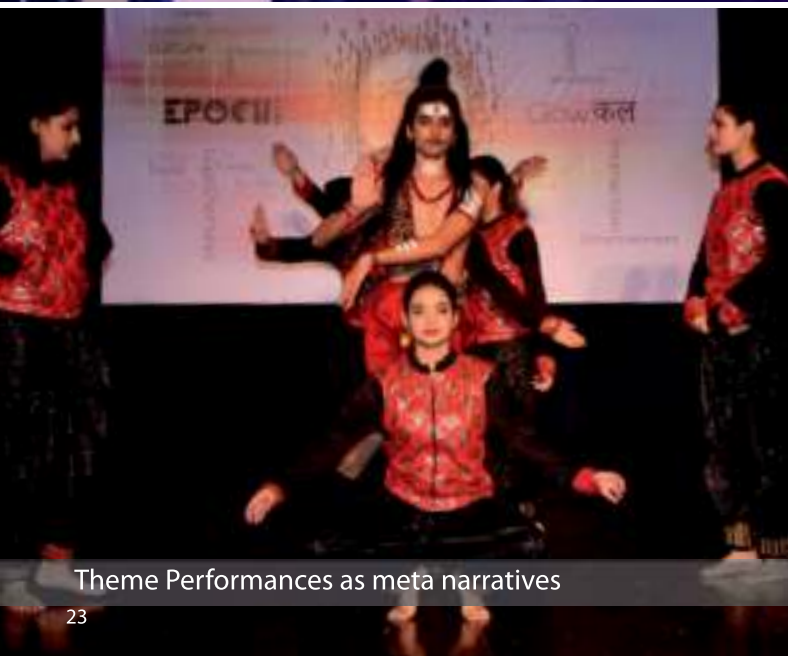
Theme Performances as meta narratives