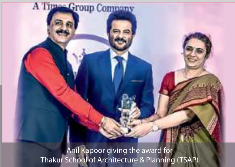
Anil Kapoor giving the award for Thakur School of Architecture & Planning (TSAP)