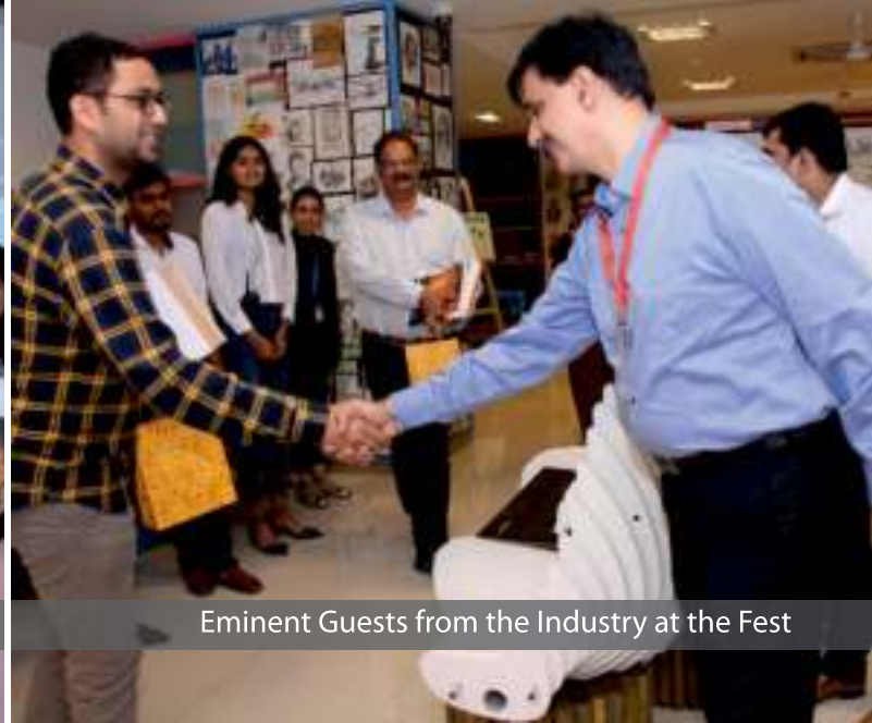
Eminent Guests from the Industry at the Fest