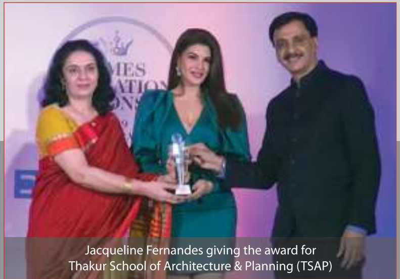
Jacqueline Fernandes giving the award for Thakur School of Architecture & Planning (TSAP)