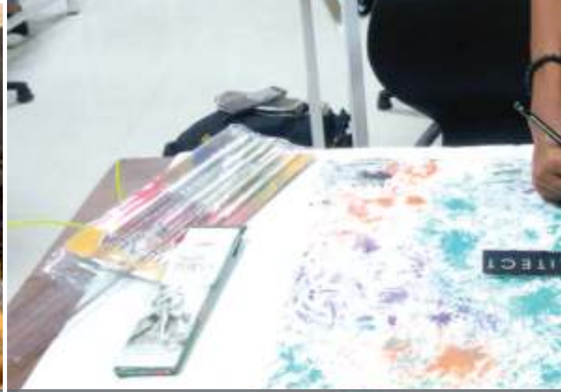
Exploration on various Drawing and Technical Skills through