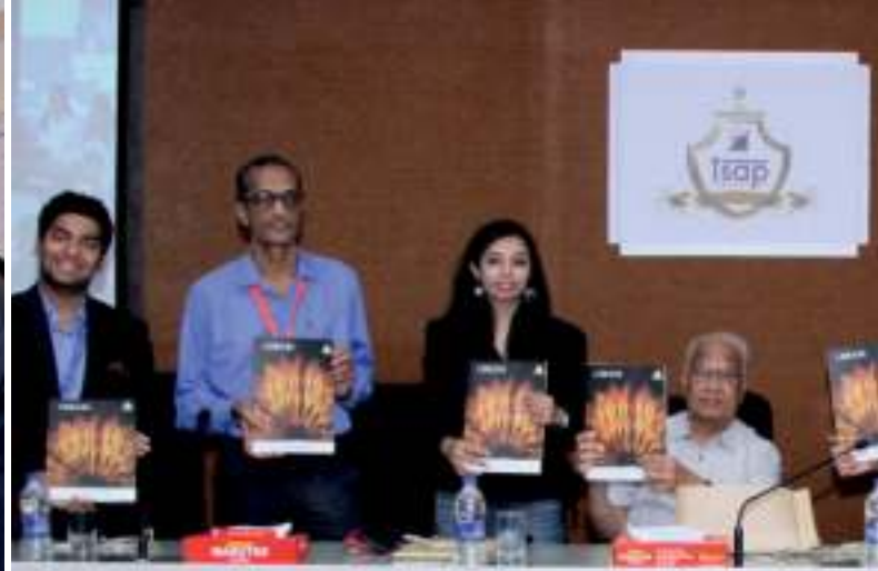
Launch of TSAP Magazine 'Luminarie' by Eminent Guest Ar.