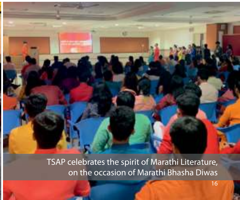
TSAP celebrates the spirit of Marathi Literature, on the occasion of Marathi Bhasha Diwas