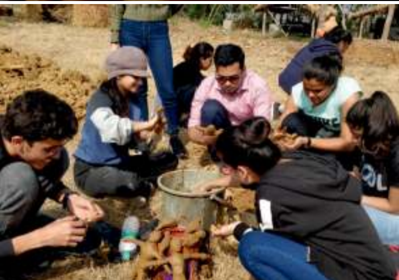
Second Year to Manav Sangrahalay (Hands on Workshop), at Bhopal, Madhya Pradesh