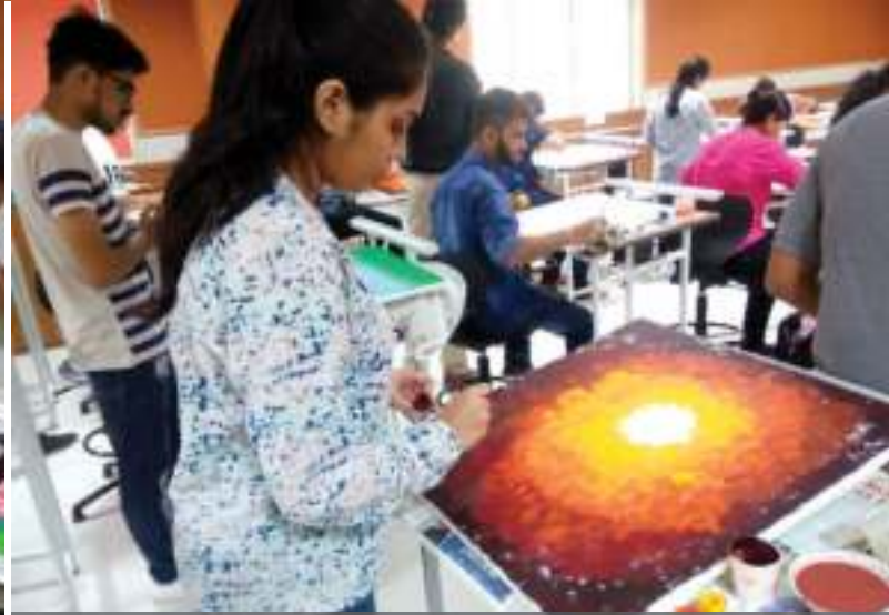
Painting on Canvas