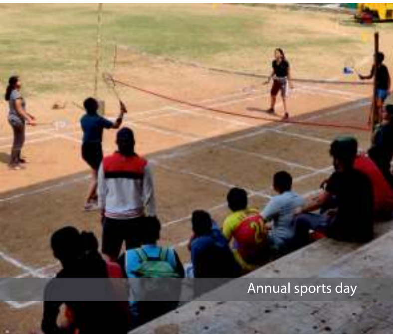
Annual sports day