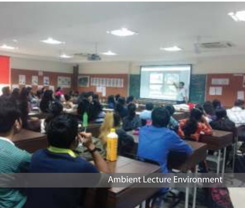
Ambient Lecture Environment