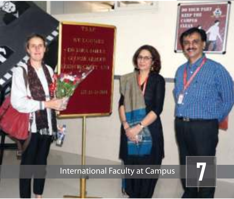
International Faculty at Campus