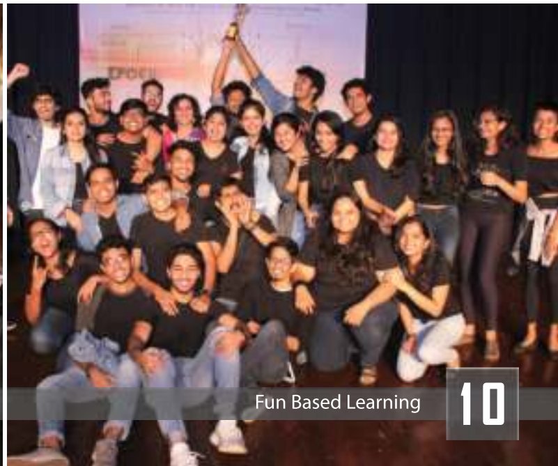
Fun Based Learning