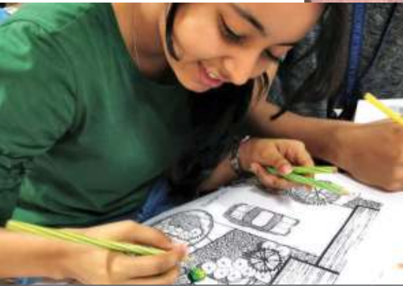
Rendering and Presentation