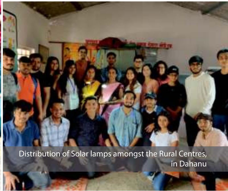
Distribution of Solar lamps amongst the Rural Centres, in Dahanu