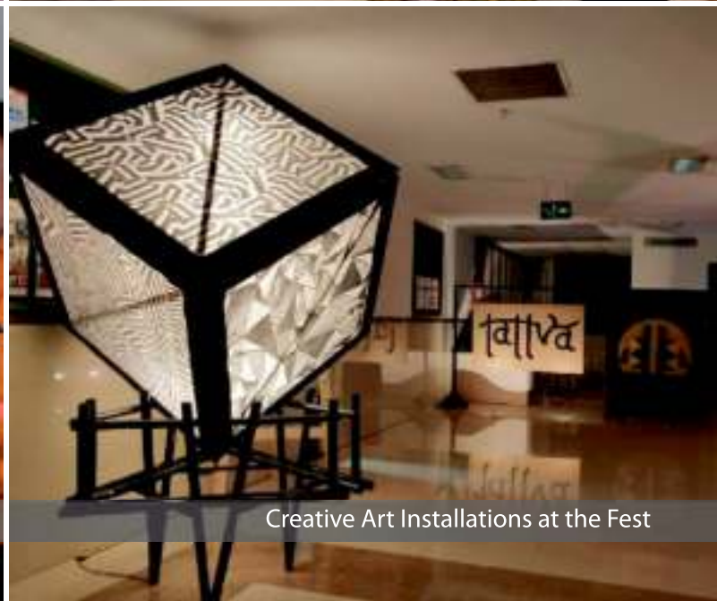
Creative Art Installations at the Fest