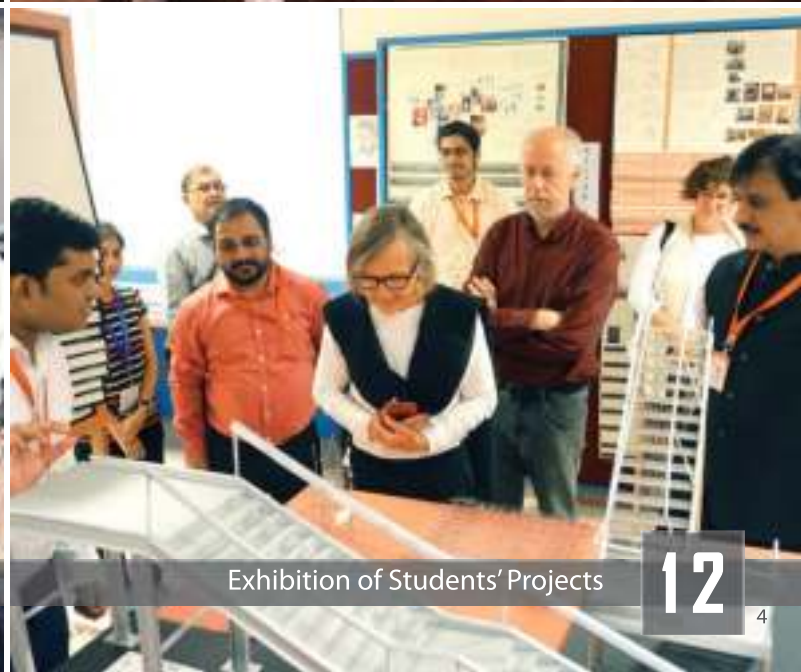
Exhibition of Students' Projects