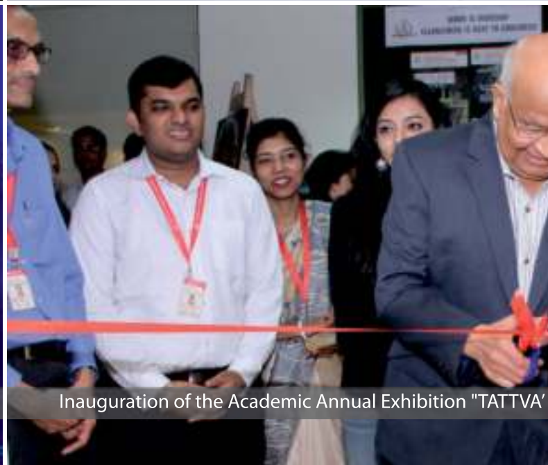
Inauguration of the Academic Annual Exhibition "TATTVA"