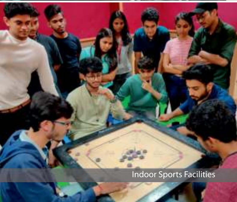
Indoor Sports Facilities