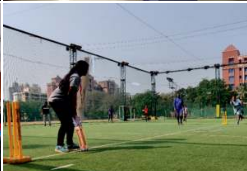
Outdoor Sports Facilities