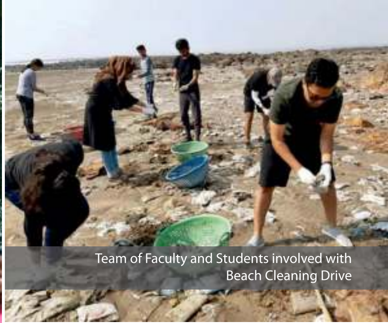
Team of Faculty and Students involved with Beach Cleaning Drive