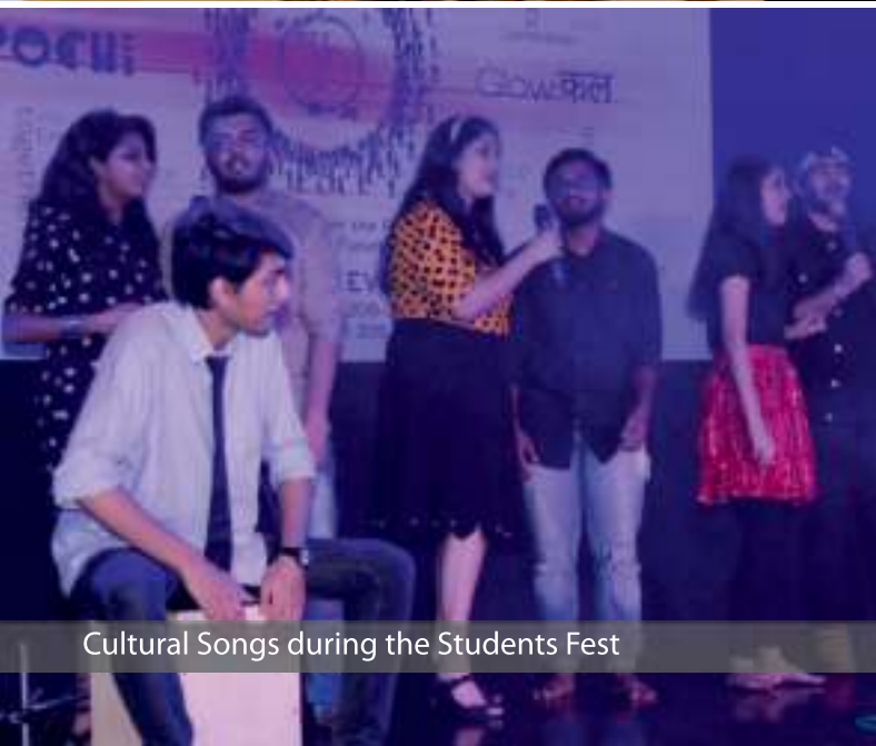
Cultural Songs during the Students Fest