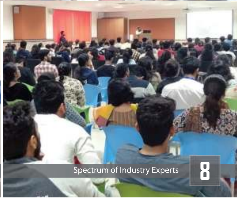
Spectrum of Industry Experts