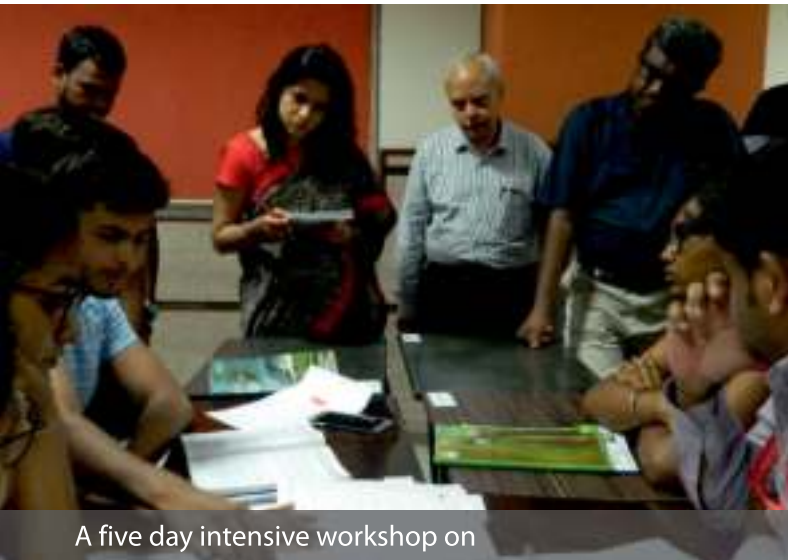
A five day intensive workshop on 'Green Buildings & Energy Conservation Building Code'