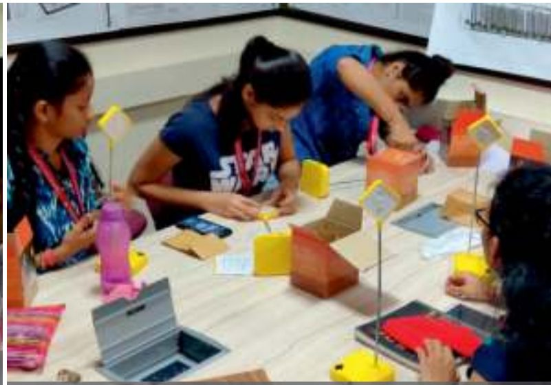
Eco Friendly Solar Technology