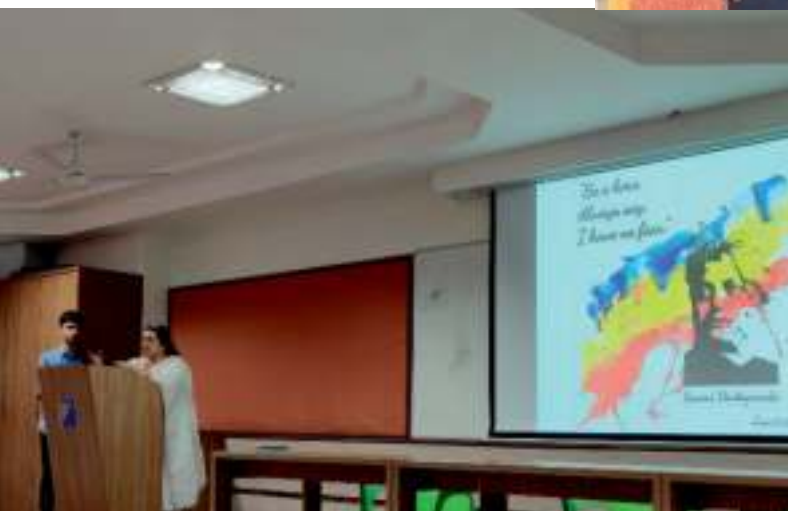
TSAP remembers life lessons of Swami Vivekananda on his birth anniversary