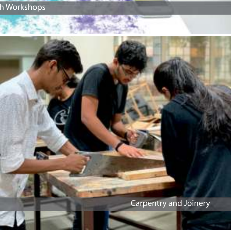
Carpentry and Joinery