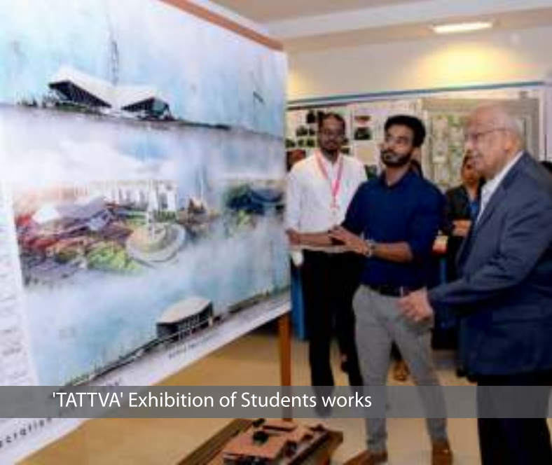
'TATTVA' Exhibition of Students works