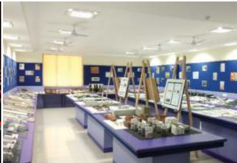
State of the Art Material Muesum