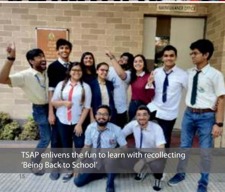
TSAP enlivens the fun to learn with recollecting 'Being Back to School'